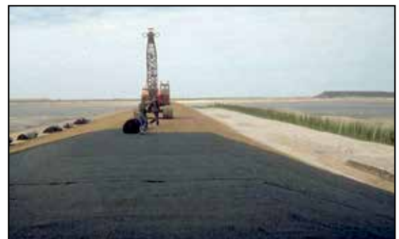
Levee armoring application